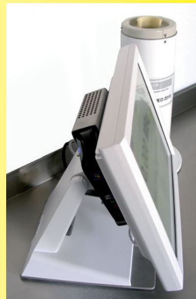
ISOMED 2010 with nettop and 15" LCD-touch-screen